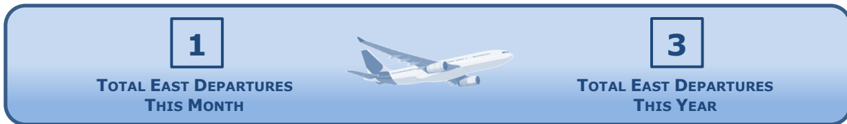
East Departures Yearly Comparison

The number of East Departures may vary from month to month due to weather, air traffic volume, and/or operational factors.