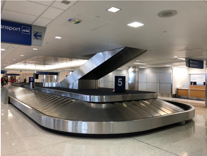
Terminal 5, Arrivals Level