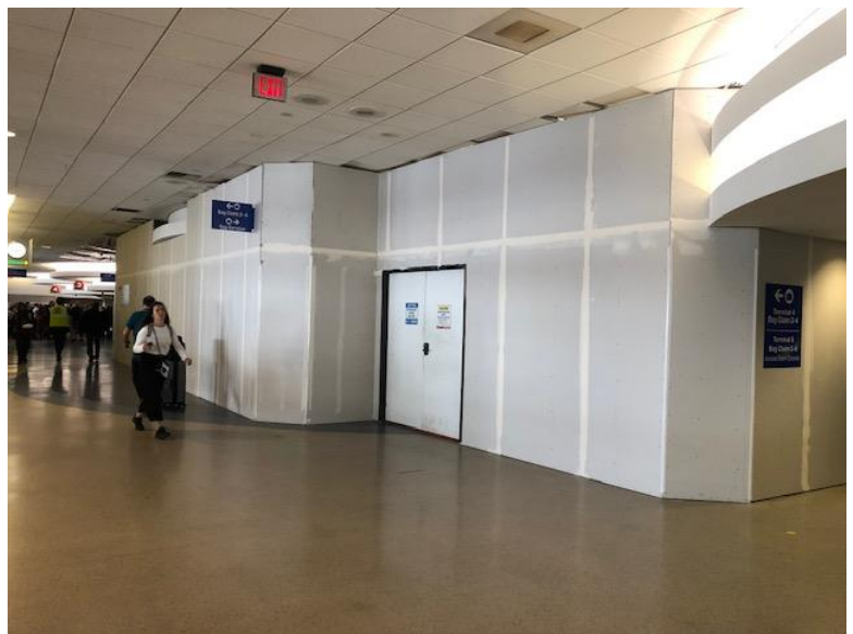
Terminal 4, Arrivals Level