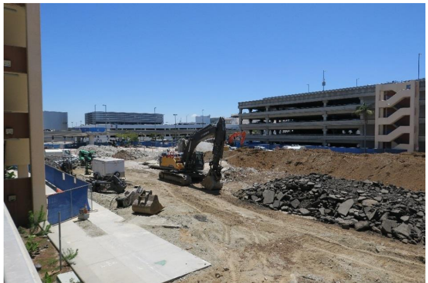
World Way to Upper West Way Ramp Demo – “After”