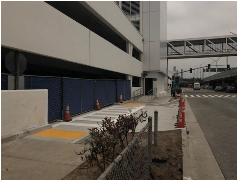
Parking Structure 7