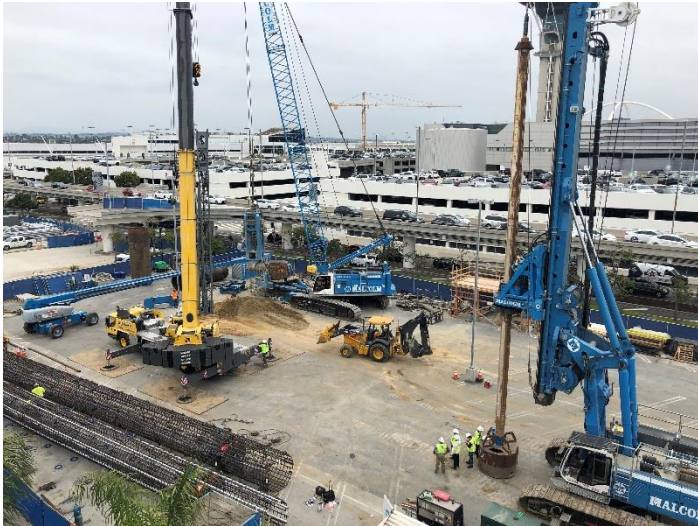
Surface Lot 4