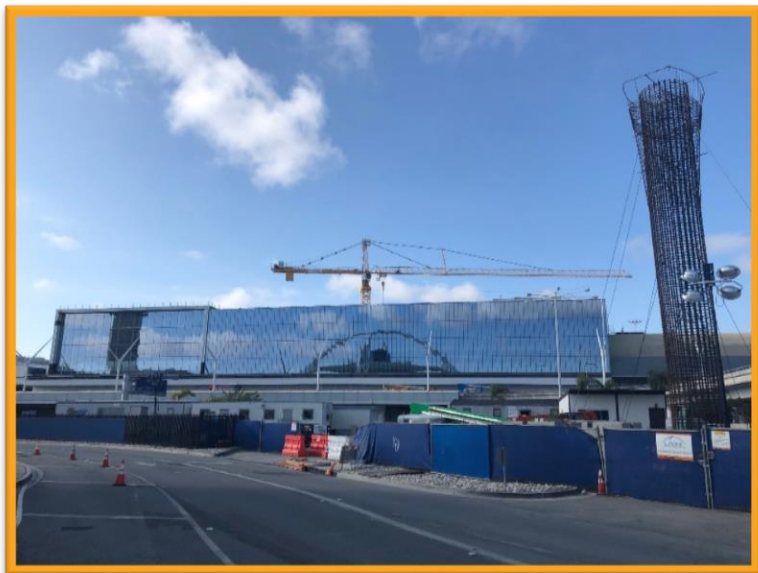
Terminal 1.5 glass panel installation complete