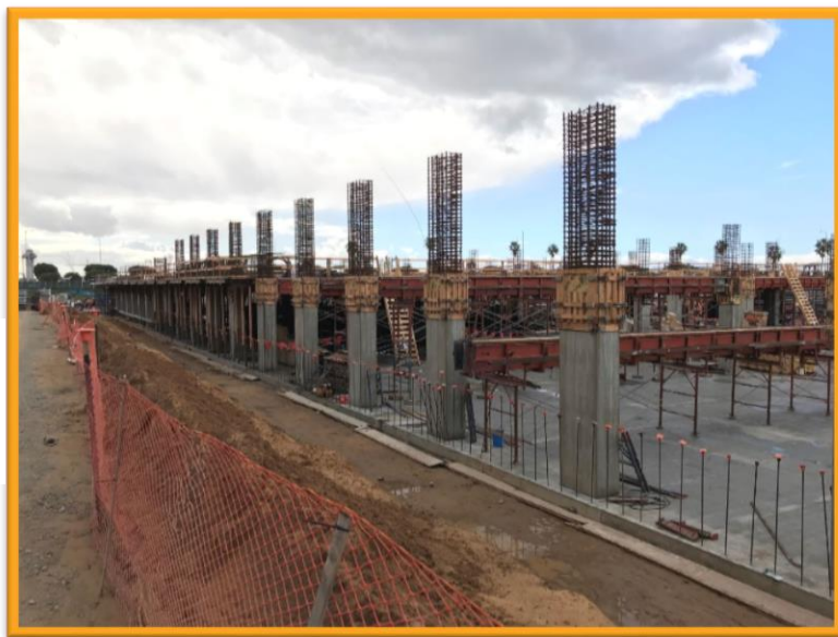
Airport Police Facility Project Site (Westchester)