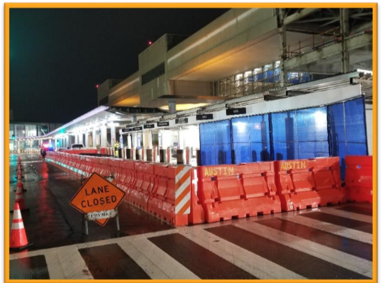
Terminal B Departures Level